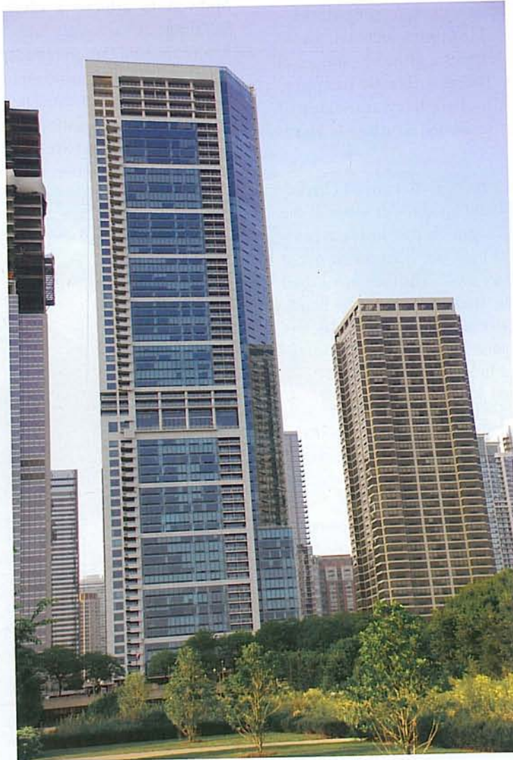
Fig. 2 – 340 on the Park awarded LEED™ Silver certification from USGBC

Post-Tensioning Supplier: AMSYSCO, Inc., Romeoville, IL